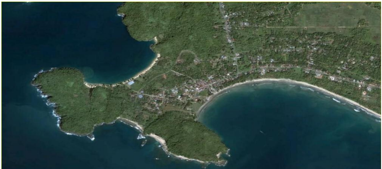
Figure 1. Satellite image of Calang city.

Considering the previously described ODD protocol, we are implementing the conceptual model of TES using NetMAS, a multiagent software tool. We choose the area of Calang City, in Aceh Jaya district of Aceh Province, which is a high tsunami risk region. The considered area is 4 Km x 2 Km, or 8 Km 2 , with a population of 7.683 people. The satellite image of Calang City is given in Figure 1.