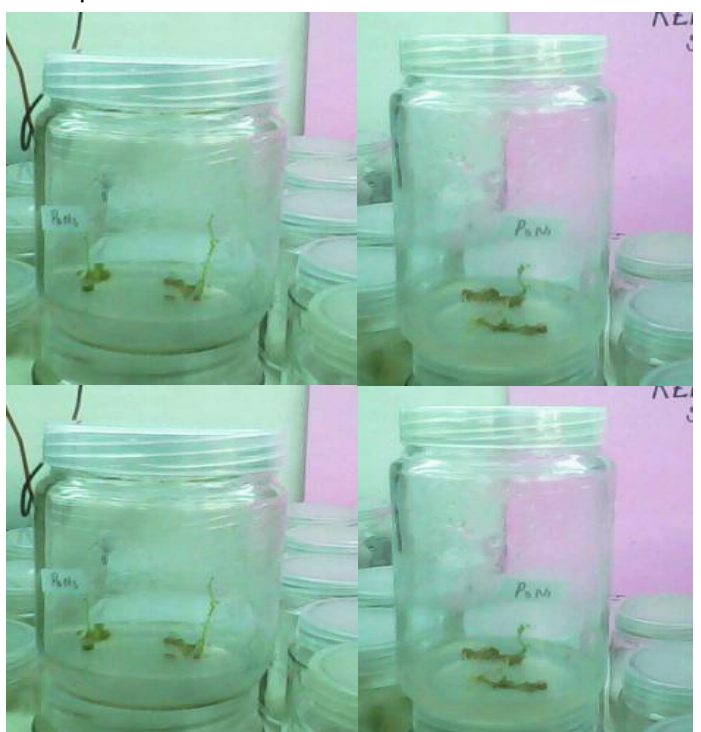
Figure 1. Planlet Potatoes Growing in vitro at the ages of Six Weeks with PEG Treatment

the addition of PEG, which in turn lead to the decreased of proliferation of tissue explants, growth and shoot regeneration. The Number of Roots. The relationship between the concentration of PEG with the number of roots of potato explants also following the negative linear regression, with an equation of Y = -0.062x + 4.112, R^2 = 0.939 (Figure 4). The Number of Nodes. The relationship between the concentration of PEG with the number of nodes was following the linear regression with an equation of Y = -0.068x + 5.105, R^2 = -0.904 (Figure 5). The use of PEG as osmoticum was suspected to stress can reduce plant cell elongation and expansion, which in turn lowered the growth rate. Sirait, et al. (2012) also showed that PEG treatment significantly lowered the number of roots, number of nodes, number of leaves, plant height and wet weight of explant.