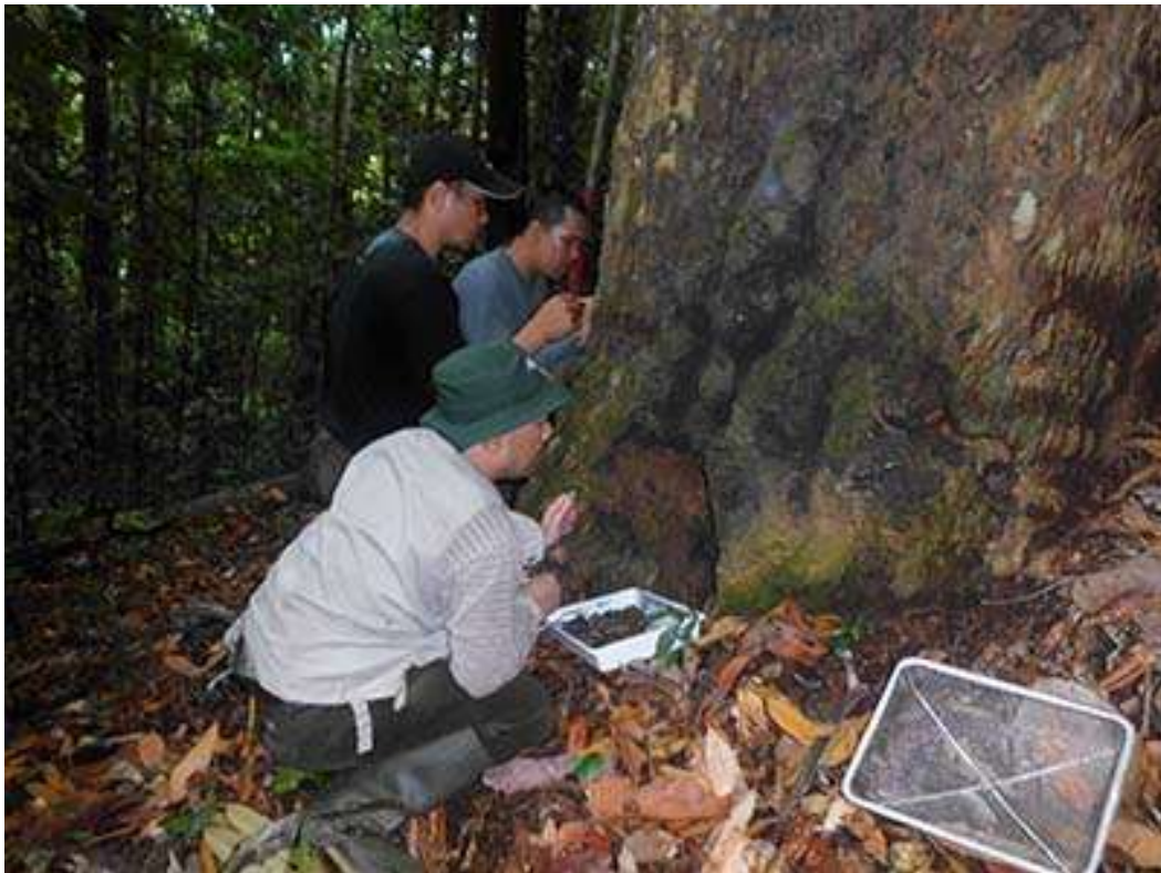
Figure 2. Finding colony of H. hospitalis at base of tree at Pararawen, Central Kalimantan.