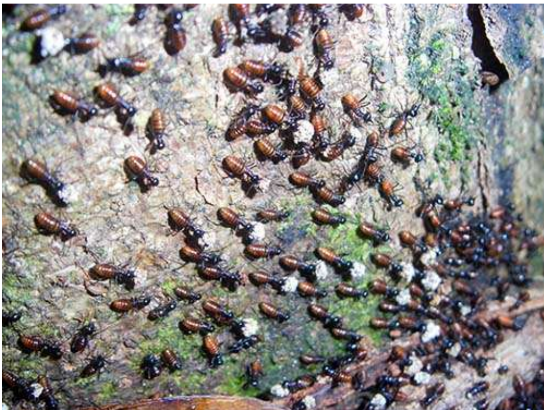
Figure 3. Soldiers and workers of H. hospitalis are in a processional column at Borneo.