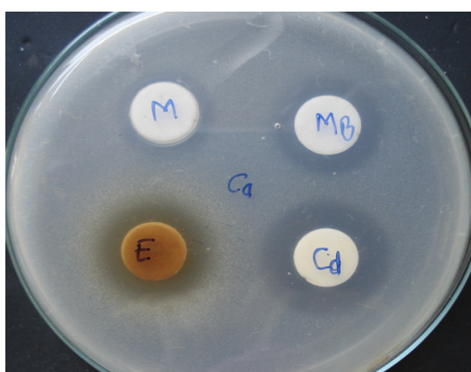
Figure 1. Growth inhibition of C. albicans (Ca) caused by M (minyeuk simplah), MB (minyeuk Brok), E (ethanol extract of pliek u) and Cd (candistin).