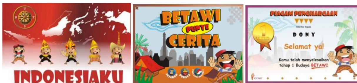
Figure 2. Display web portal page

culture, Makassar/Bugis culture, Dayak culture and Flores culture. After clicking one of the icons, an animation of the origin of the selected culture will appear and another history, culture and national hero buttons from the selected culture will also appear. If the history button is clicked, an animation story that narrates the history will appear and narration, video, games and quiz menu will be flashed. If the quiz menu is selected, a series of questions that will be answered by the students will appear and by the end of the last question, the total score will be displayed and there is an option to print the score. If the culture is selected, introductory narration animation will appear and another set of music art, dance art, traditional clothes, houses, foods and drinks buttons will appear. After the buttons are chosen, a similar menu as the history button will be displayed.