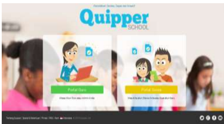
Figure 1. Quipper's homepage

Quipper School can be accessed at http://www.school.quipper.com/ . Unlike other web-based learning management systems, Quipper School has a user-friendly interface that will comfort the users with limited knowledge of internet. The homepage is colorful and attractive so it will probably make students experience learning in a fun way.