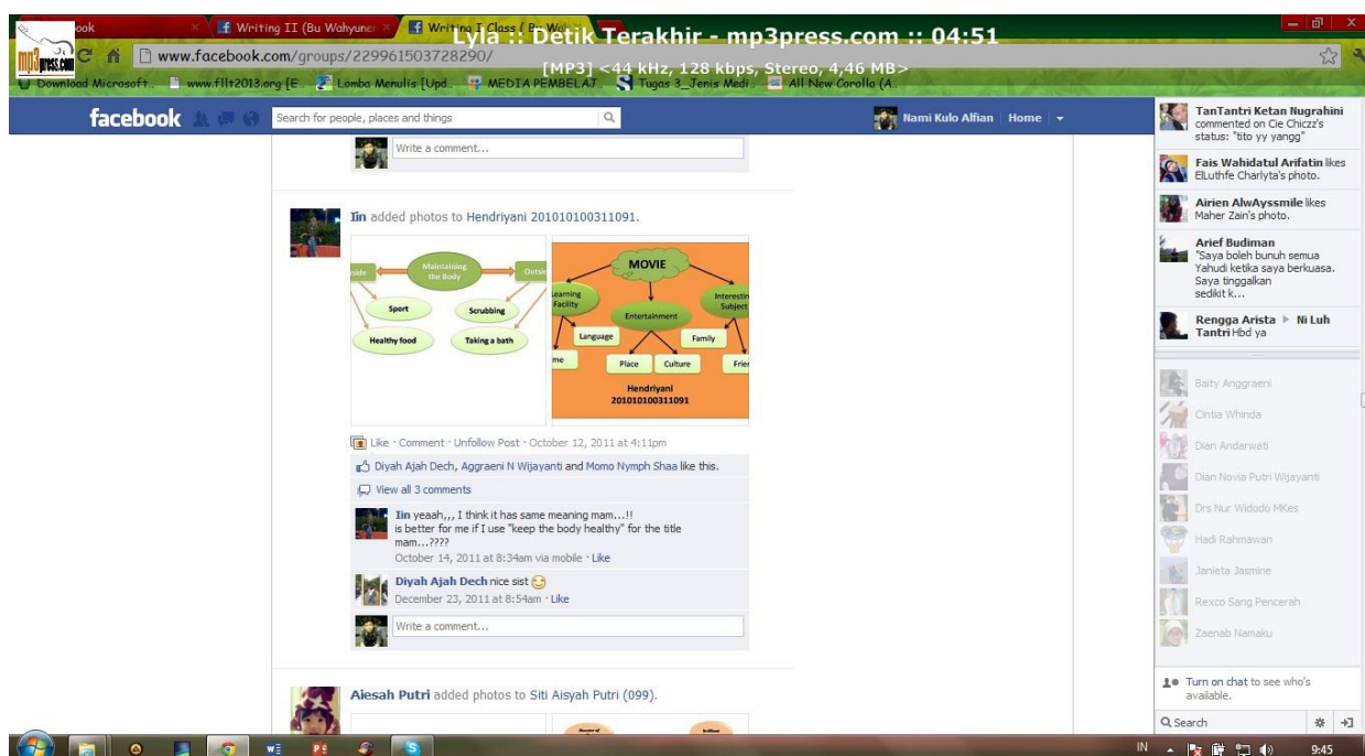
Fig. 2 The sample of student's work in making mind mapping.

In starting the teaching process, teacher may give some materials in the classroom as brainstorming to the students. It can be the way of organizing idea in a paragraph or even an essay and also the rules in academic or scientific writing. Next, by those materials, the teacher stimulates them to develop and enrich their knowledge about it and give them an assignment as reinforcement for students. In classroom activities, teacher may guide the students' study process and create student centered approach. They should stimulate students to have independent learning and being active during the learning activities in the classroom. Teacher has an important role in this approach to direct and guide the students to avoid unexpected thing.