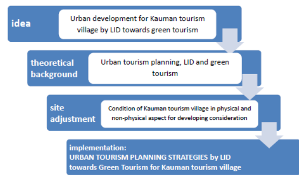
Gambar 1: Research Framework

The study was conducted in the historical district of Surakarta Kauman tourist village, based on local knowledge of potential factors that have historical value. Village Kauman selected as the research object because it is associated with the presence of Surakarta palace compound as a symbol of a cultural center that still exist. The study begins with the primary and secondary data collection, verification and subsequent data processing. Data collection through: a). surveys and interviews with questionnaires to map the socio-economic and cultural conditions, b). methods refer and reference maps, as well as c). FGD and PRA to capture the needs and aspirations of the people. Data processing using SWOT analysis techniques, descriptive statistics and interactive analysis and behavioral approaches background.