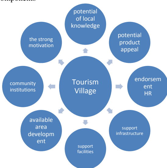
Figure 2: Eight Components Shaping Tourism Village

Suhartanti (2000), says that is a typical characteristic of Indonesian life, the settlement must reflect the presence of family life, the degree of worth, religious harmony and promote mutual support and mutual benefit. Thus the character of the settlement that grew to support the development of tourist villages in Surakarta. There are three main components as the basic foundation of the development of the city kampung (Access; resources and motivation, with different ability levels of each component, it will be in shape or different phenomena in the city village. Components