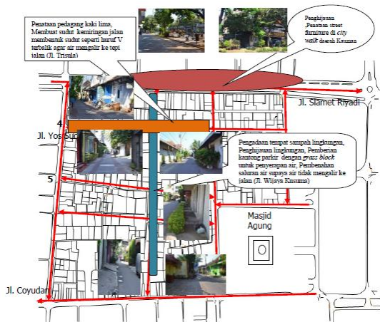
Figure 5. GREEN LID implementation in the region and towards Kauman as Kauman for Tourism Regions Based LID and Green

Further in support of the existence of Historic Areas Kauman as Village Tourism Concept LID Towards Green Tourism, then there are several criteria that must be considered,