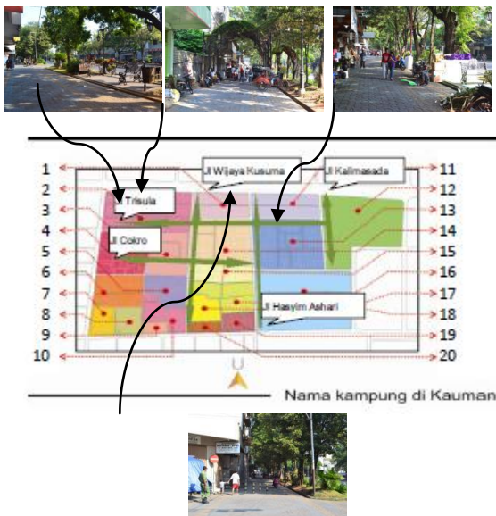
Figure 4: Five Main Road and Village Kauman Kauman