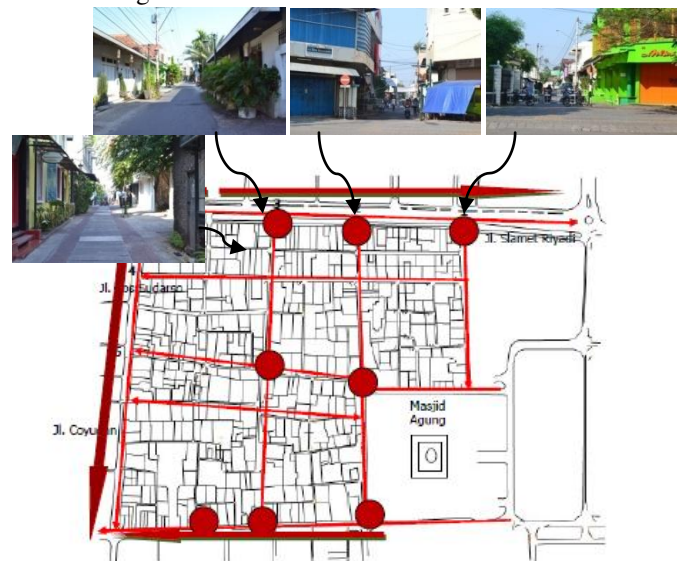
Figure 6 Orientation and Main / Side Entrance

To facilitate and make it convenient marker made road users to reduce possible road travelers astray and make it easier to achieve the goal.