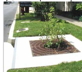
Figure 3. Application of filter strips on open space

Some application of LID: "Bioretention or rain garden, grass channels," filter strips, "and the pavement" permeable".