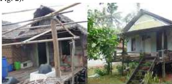
House of Bajo People House of Bugenese

Karimunjawa is also known as a melting port area, where more than ten ethnicities live in harmonious in this archipelago. There are about ten ethnics live in, i.e. Javanese, Buginese, Bajo, Maduranese, Buton, Mandar, Ambon, Flores, Batak, and Luwu. Javanese and Bugenese are the majority. Group of ethnic live separately and it establish a certain pattern of residential community in Karimunjawa. Javanese mostly live in Karimunjawa, Legon Lele, Nyamplungan, and Mrican. And Bugenese reside at Batu Lawang, Legon Gede, and Tlogo. The Bajo people gather in Karimunjawa just near the sea. This ethnic is well-known as “manusia perahu” (boat man), because they usually live on the boat, and sometimes do not have house in the mainland. However, the Bajo people who live in Karimunjawa seem to build permanent wood house in the seashore. Mandar, Maduranese people are commonly found in Kemujan, near the Bugenese residential area. A small community of Buton and Luwu stay in the west seashore of Karimunjawa Island, just close to Kampong Bajo. Those ethnics can be easily distinguished from the type of house (Fig. 2).