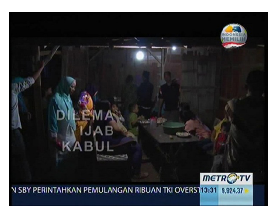
Picture 2. The cover scene of documentary film Dilema Ijab Kabul has aired twice on Metroty.

This film depicts the social life on the slope of the mountain. Social phenomenon raised in this film is a tradition in the community, marrying their children withing under age marriage. An interesting culture in the documentary film is when there is a social culture in the farmers habitation on the slope of the mountain which leads them to the experience of social psychological shock. Psychological shock is shown by the behavior of the girl's parents in a pressure, fear, and feel anxious when there is no man who wants to propose their daughters.