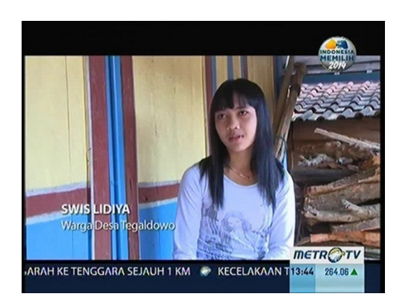
Picture 6. An under age widow who has been married three times on the film scene Dilema Ijab Kabul .

The narrative above has two stages in identifying a subject who has a dominant role in the wedding procession. In 2006, a Muezzin has helped the implementation of the wedding ceremony. But in the same year, he also accompanied to succeed the divorce.