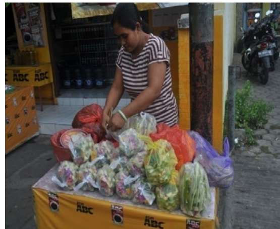
Figure 1. variations of Canang Sari commonly sold by women as street vendors of Canang Sari in several cities in Bali. In the right, a woman is arranging her Canang Sari . (Documentation Atmadja, 2015).

This fact obviously shows on how betel, betel nut and lime are preferred by society, even they are served to guests and