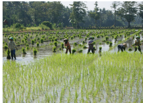
Picture 4. Agricultural Activities (in Kendal) on the material of agricultural activities