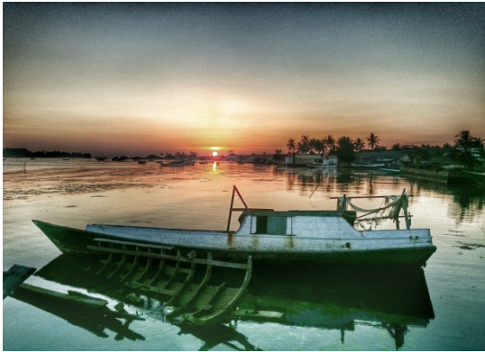
Picture 2. Traditional Sea Transportation (in Karimunjawa) on the material of mobility infrastructures for people