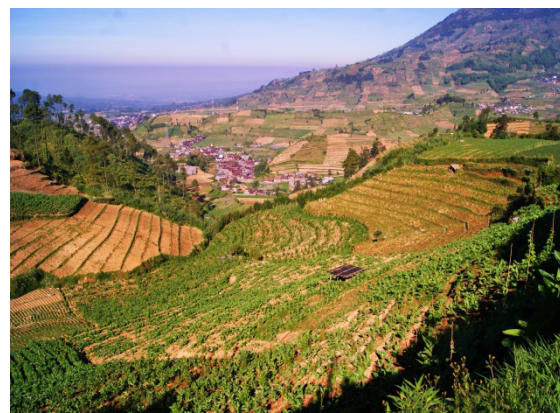
Picture 5. Teracing (in Wonosobo) on the material of teracing in agricultural area