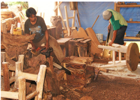
Picture 3. The activity of wood production (in Jepara) On the material of forestry activities