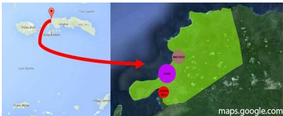
Figure 1. Research Sites in Negeri Kawa: Kawa, Waeyoho and Pohon Batu Villages

Negeri (village) Kawa is a custom village which is located on the western tip of Seram Island in Maluku Province. The landscape of Negeri Kawa is unique because it is formed spontaneously by three large ethnics spreading in five villages. The three ethnic groups are from Maluku, Butonese, and the most recent one is Javanese. Each ethnic group's cultural landscape pattern forms their own character, although all of them remain under control of the King of Kawa as traditional leaders and chief of Negeri Kawa.