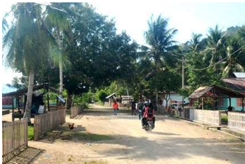
Figure 5.- Degu Degu in the front yard of Waeyoho Village

The only ritual in the fishermen cultural system is Sasi Laut which is carried out by the King of Negeri Kawa. Sasi Laut is one of the rituals that reflect the local wisdom of Maluku community in environmental conservation efforts. This activity aims to