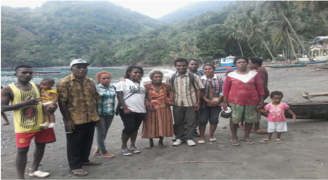
Figure 2. Yokari's community, taken during data collection process

Much of the Yokari area is used to build Jayapura government's office buildings, public facilities, and infrastructure. To participate in the current development of the regency, many non-indigenous people from other regencies and cities of Indonesia spread and build their business around the district. As a result of Indonesia's transmigration program, many people from other provinces in Indonesia arrive to make a living in this regency. This situation creates a significant gap between the non-indigenous population and indigenous Yokari's people where most indigenous people choose to live close to the sea, so they can still practice their traditional activities and use local wisdom to manage their natural resources. This is why the researchers also understand that the nature and obligations to protect it are very important for Yokari's tribe.