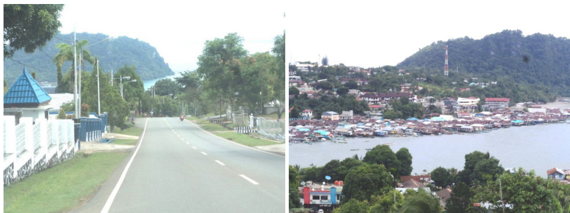
Figure 3 Settlement of fishermen on the docks IX (left) and upper-middle class neighborhood in Dok V inhabited by the ethnic mix (right)

Jayapura City residents are fishermen living on the coast. Papuans who work as fishermen are from local ethnic communities (Kayu Pulo, Kayu Batu, Tobati, Enggros, Nafri), Biak, Seruim, and Sorong. And non-Papuan fishermen are from ethnic Buton, Bugis and Makassar known as BBM. Local