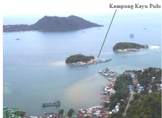
Figure 2 Native settlements of Jayapura: Kampung Kayu Pulo (left) and Kampung Tobati (right)