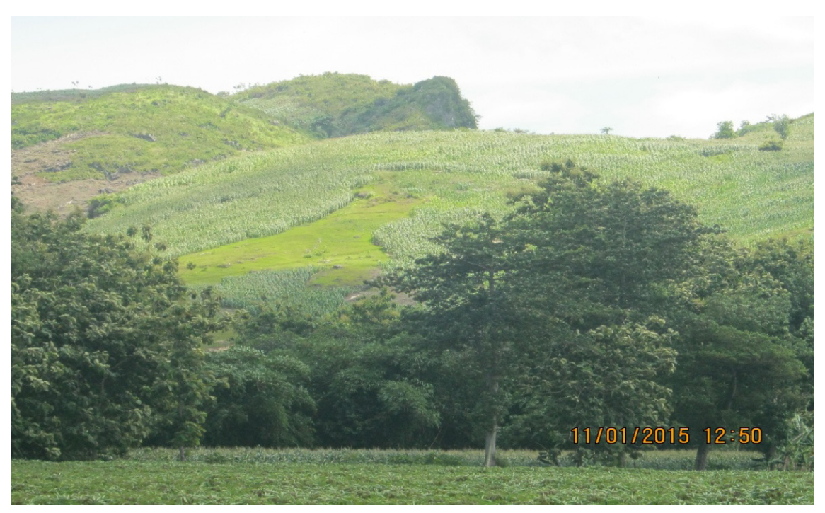
Pictute 1 : North Karts Kendeng Sukolilo

Kendeng They corcerned great lengths to preserve the nature around North Kendeng Mountains.