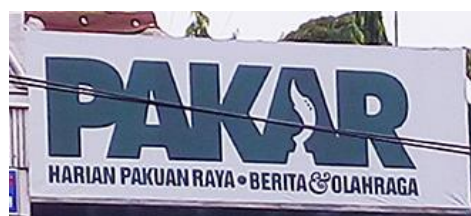
Figure 2 Logo of PAKAR, Hariian Pakuan Raya, Bogor

The basic principle closure or Principle of good form explains that the eye or the mind perceptually will tend to fill the void or close an object pattern shape of the incomplete observation form for the purpose of affecting a person's mind or imagination in translating visual. Figure 2 applies the basic principles of closure. The logotype of PAKAR with the letter A on the right is covered with the visual of the cleaver, but it still can be seen as the complete letter of A. This logo is unique and innovative.