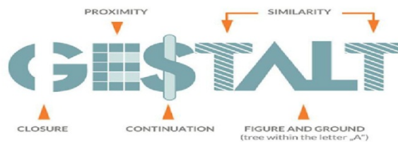
Figure 1 The Basic Principles of Gestalt

There is an organizational tendency that has a universal nature in humans, including the Gestalt principles of grouping based on the human tendency to be organized by stimulation which likes to be grouped by proximity, closing equality, and continuity. According to the Gestalt principle, if stimuli are containing two or more distinct areas, it would normally be seen as separate from the image and the back image as the rear. The area in question is an attentive, visual image will appear denser than the background and visible at the back. This is the most basic form of perceptual organization. The process of perception will be done. In comparable circumstances, objects and backgrounds can be exchanged that result in ambiguity or ambiguous relationships. The Gestalt principles do not see or judge the element by its visual as a whole. The approach of it describes perceptions. It is applied by the visual perception by Max Wertheimer, Wolfgang Köhler, and Kurt Koffka who introduced the Gestalt approach to the perception of Gestalt theory. This form has become one of the basic designs of logo making.