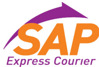
Figure 6 Logo of SAP Express Courier, Bogor

Continuity basic principle can be explained that the eyes or mind perceptually likely to follow an object visually arranged or designed such that can direct the eye to follow a certain direction. As visual arrows that rotate to provide a certain direction in our eyes. Other examples of some groups form a small circle or dot creates an optical illusion in the form of rhythmic movements to direct the eye to a particular direction. SAP Logo Express Courier applies the basic principles of continuity. There is a visual arrow moving from the bottom of a small form then enlarged with an arrow-shaped tip. The arrows form impresses the eye that caused motion as if it moves from the bottom up of small and then expand. This logo has an element of the basic principles of continuity that is unique and innovative. It can be seen in Figure 6.