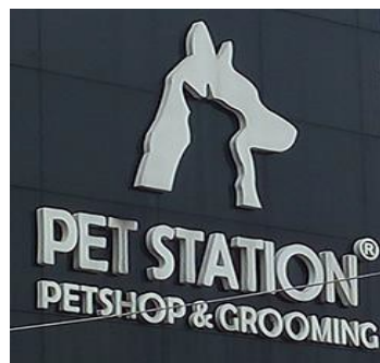
Figure 5 Logo of the Pet Station, Bogor

The logo in Figure 5 is quite unique and creative, the visual identity which can instantly draw of the main business of pet shops. Visual identity is depicted with two animals at once, the dogs and cats into a unified whole. Figure or foreground can be seen as a visual of dog, and the ground background can be seen as no animals of the cat. This logo uses the basic principle of figure and ground that are quite unique and interesting. The fact that the two areas can be recognized as an image which states that the organization of the figure-background is not part of the physical stimulus, but it is an achievement of the perceptual system. This principle assumes that every field of observation can be divided into two positive space (figure) and negative space (ground). It can be seen in Figure 5.