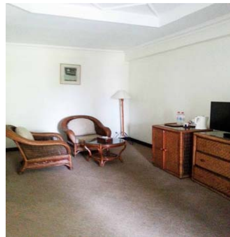
Figure 22 and 23 Kartika Wijaya Hotel bedrooms

Meanwhile, Kartika Wijaya Hotel's furniture used rattan materials with modern tropical style. Each and every room in Kartika Wijaya Hotel does not use Air Conditioner since the location itself in Batu, Malang already has cool climate.