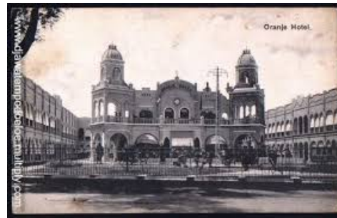
Figure 2 Majapahit Hotel, Surabaya, (Source: http:// www.google.co.id )