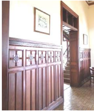
Figure 14 Art Deco motifs, wood paneling Kartika Wijaya Hotel