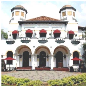
Figure 1 Kunskring Palais, Jakarta.

In Malang, within 2 hours from Surabaya, Dutch heritage buildings was in the territory of Batu-Lawang, which is a cool area, so that the legacy of historical buildings in this region are located in resort area like villas or hotel . Old Netherlands buildings that have functions and historical are very important for the history of this nation. Here are examples of some historical buildings in major cities of Java island, which has an old -style Western / European buildings. Old Western-style buildings in Jakarta, old European-style buildings, among others in the area of the Old City located in the area of Menteng. In Bandung, this place can be seen in Braga and Surabaya.