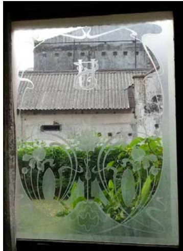
Figure 8 Art Nouveau motifs, Sandblasted glass window, Niagara Hotel