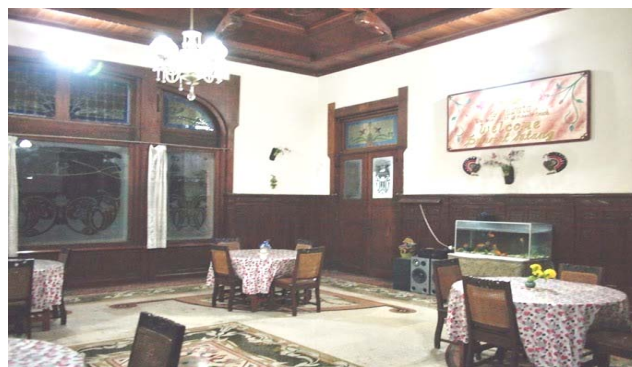
Figure 20 Classical style coffee shop with Art Nouveau interior detail

The ambiance in the Hotel Niagara coffee shop has the classic impression with many Art Nouveau details that are still well preserved and are still the same with the one from 100 years ago, consisting of classical building with many big stained glass windows. It seems that materials made of glasses dominated the wall area especially in the lobby and coffee shop area which added openings to the rooms and allowed sun rays to burst into the room. Besides giving the light effect, stained glass windows can also become good air ventilation.