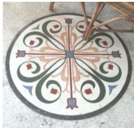
Figure 11 Art Nouveau motifs, floor pattern Niagara Hotel