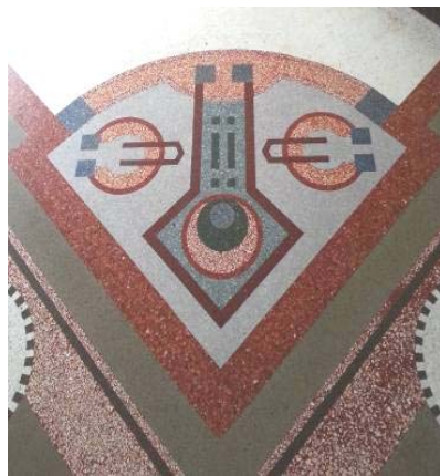
Figure 5 Floor pattern with Art Deco style, Lobby Area