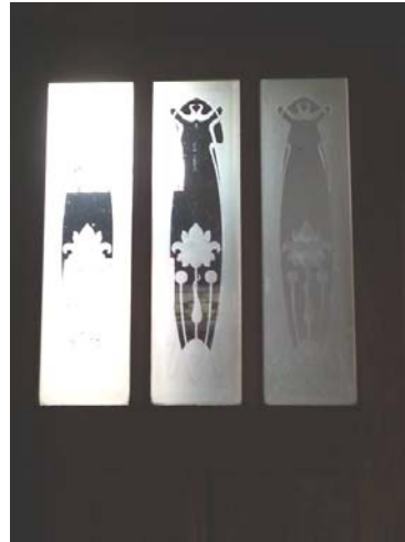
Figure 9 Art Nouveau motifs, Sandblasted glass elevator door, Niagara Hotel