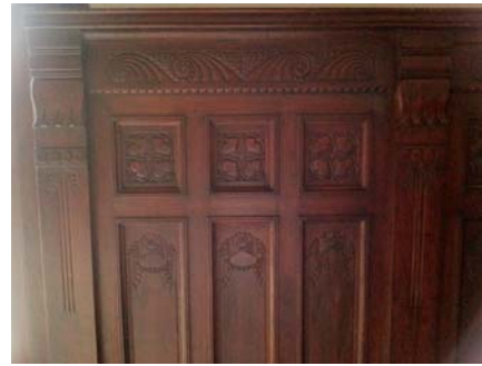
Figure 15 Art Deco motifs, wood paneling Niagara Hotel