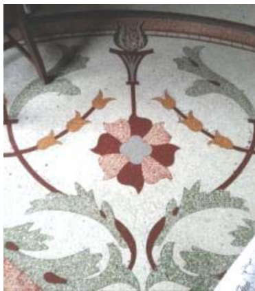
Figure 10 Art Nouveau motifs, floor pattern Niagara Hotel