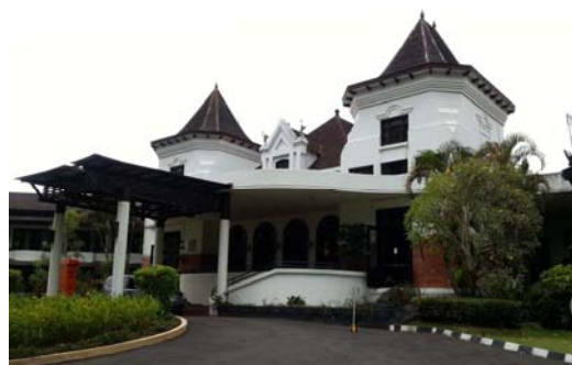
Figure 4 Kartika Wijaya Hotel, Malang

Modern urban experts generally agreed that buildings and historical districts can increase an image and identity of a city. The existence of historical buildings able to shape up local values in the form of architectural history which can give distinct image for a city (Johana, 2004). Kartika Wijaya Hotel (fig.4) is one of the historical hotels located in Malang. The constructions were pioneered by the Sarkies brother, hotelier from Armenian in 1891 as a resort villa for the family built in European architecture style.