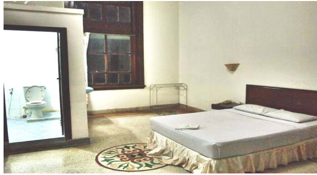
Figure 21 Niagara Hotel Bedroom

Only 15 out of 26 available rooms are operated in this Niagara Hotel. While the Kartika Wijaya Hotel, Batu has 85 rooms. Discussing about the furniture and design styles, the Niagara Hotel used wood materials for the furniture with dark finished with and adopting modern classic style.