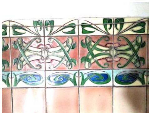
Figure 16 Art Nouveau ceramic motifs Niagara Hotel