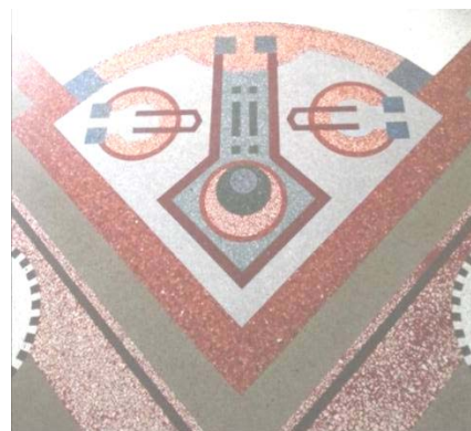
Figure 13 Art Deco motifs, floor pattern Niagara Hotel