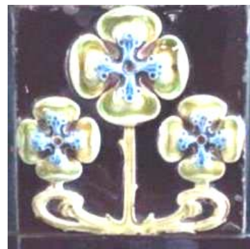
Figure 17 Art Nouveau ceramic motifs Niagara Hotel (Source: Sri Rachmavanti, 2014)

At the beginning, Niagara Hotel was built as a family villa, Art Nouveau design style were mostly used to decorate the ceramic wall and big sandblasted glass windows especially in the lobby and coffee shop area as well as sandblasted glass in the upper windows and doors. The floor pattern in lobby area has a very unique and sophisticated detail, using Art Deco style pattern. In those details, it can be seen rectangular geometrical pattern as well as circular pattern in a very simetrical form. Unfortunately, the recent renovation of reception counter pay less attention to the surrounding style and design which make the whole room uncohesive in design style and color composition.