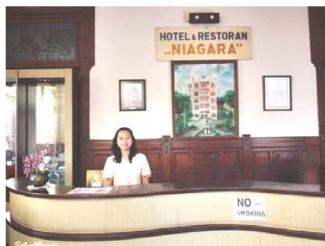
Figure 18 Reception Lobby, Niagara Hotel

At the beginning, Niagara Hotel was built as a family villa, Art Nouveau design style were mostly used to decorate the ceramic wall and big sandblasted glass windows especially in the lobby and coffee shop area as well as sandblasted glass in the upper windows and doors. The floor pattern in lobby area has a very unique and sophisticated detail, using Art Deco style pattern. In those details, it can be seen rectangular geometrical pattern as well as circular pattern in a very simetrical form. Unfortunately, the recent renovation of reception counter pay less attention to the surrounding style and design which make the whole room uncohesive in design style and color composition.