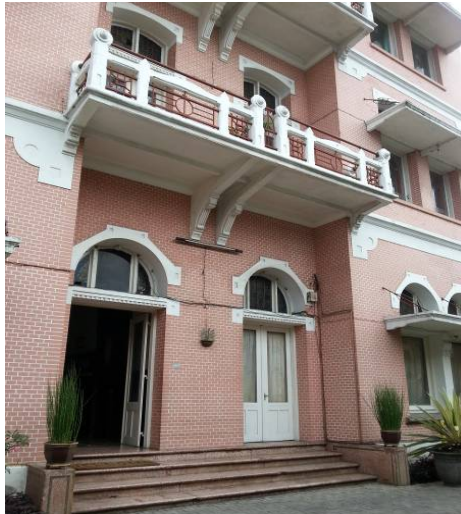
Figure 6 Front Façade of Niagara Hotel, Lawang, Malang

The Niagara hotel has high art and historical value which not many hotels in Indonesia have. Inside the hotel, so many beautiful details from the Art Nouveau and Art Deco era can be found. In terms of architectural style, as a whole, the building can be recognized for its European Victorian style.