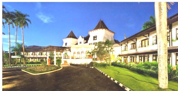
Figure 3 Kartika Wijaya Hotel, Batu-Malang

The Buildings above apply West / Europe architectural and interior style, where the existences of the buildings were the legacy of the development from Dutch occupation era in Indonesia. Preservation of old historical buildings can be done in various ways, such as not changing the function of the building, renovates the building and the easiest is done by documenting those buildings. Not many of these historic buildings are well documented. The purpose of holding documentation of historical buildings is to publicize them, and so that people can do research on them.