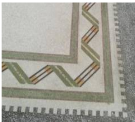
Figure 12 Art Deco motifs, floor pattern Niagara Hotel