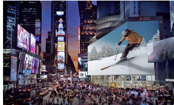
Figure 3 The 5 th screen, Digital Signage in Times Square

The combination of various technical problems allowing digital signage become the new screen that can be found in all places where the absence of four other screens. Start from checkout screen in a shopping center or the screen of a company and institution that can be used both for educational marketing, retail and employee communications environment. Kelsen (2010) has put digital signage in the category of the fifth screen. This fifth screen that creates a visual connection with the important message conveyed in the other screens that we face every day.