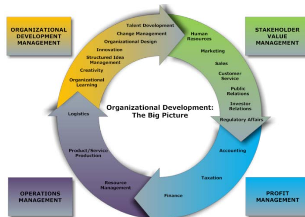
Figure 2 Definition of Organizational Development (courtesy: coloringinguy.com/46188-organizational-development)

In order to improve the effectiveness and their health, human beings use a variety of disciplines, especially the science of applied behavior. It refers to the definition of Minors on organizational development, which is a field that is directed at intervention in the human system (informal or formal groups, organizations, communities, and society). It is also based on the second definition of the development organization, which is a union between knowledge and practices that improve organizational performance and individual development, by improving the alignment between the various systems within the organization as a whole system. As an illustration, the definition of organizational development can be seen in Figure 2.