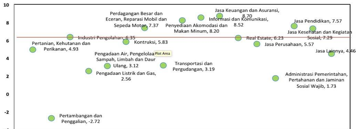
Figure 2. Average Growth Distribution of GRDP Sectors