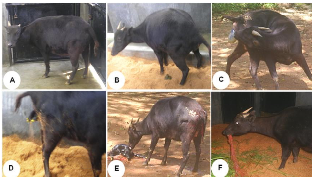
Figure 2. The serial photos described the parturation process in anoa and its behavior observed in captivity; showed the cervical mucus hanged out from vulva (A), abdominal contraction and kyphosis (B), expulsion of the amniotic membrane (C), expulsion of both fetal foreleg (D), the dam was licking the fetus (E) and eating the placenta (F).