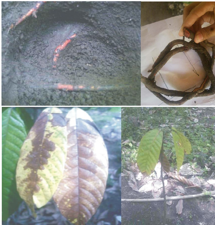
Figure 2. Symptom of Fusarium vascular dieback on cocoa in field: the root of an infected tree is apparently healthy, with no indication of rot (above); seedling planted beside infected tree showing chlorotic leaves and retarded growing (below).

Gambar 2. Gejala Fusarium-vascular dieback pada kakao di lapangan: akar tanaman terinfeksi tampak sehat, tidak ada indikasi busuk (atas); bibit yang ditanam di samping pohon terinfeksi memperlihatkan daun klorotik dan pertumbuhan terhambat (bawah).