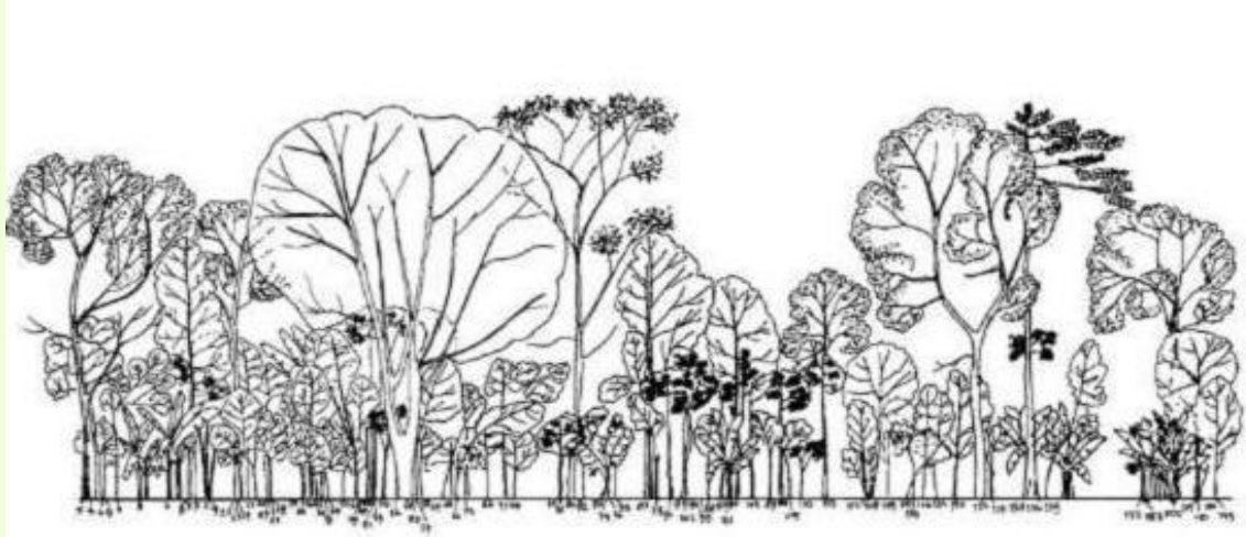
Figure 3. A profile of agroforestry systems in Indonesia: a complex agroforestry system

In Krui, West Lampung, the decline of damar trees ( Shorea javanica ) in natural forests has encouraged people to design damar agroforest to produce resin for export. Besides damar trees, farmers also plant fruit trees, wild plants from primary or secondary forests such as timber trees, palms, and bamboo to create complex agroforestry systems (Figure 3). Damar and durian trees ( Durio zibethinus ) which can reach 40 meters dominate the upper layer, while duku ( Lansium domesticatum ), mangosteen, tangkil ( Gnetum gnemon ) and rambutan ( Nephelium lappaceum ) occupy the layer within 10 to 20 meters. The middle storey (20 to 35 meters) comprises cepedak ( Artocarpus heterophyllus ), embacang ( Mangifera spp.) and petai ( Parkia speciosa ). Grasses and shrubs occupy the lowest layer of the systems (de Foresta et al. , 2000).