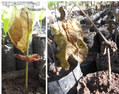
Figure 1. Symptom of Phytophthora seedlings blight

Observations on the Phytophthora seedling blight disease was performed after seven days treatment with a seven-day interval for 10 weeks. Observation was conducted by opening the lid first and then observing all variables such as symptoms of the disease, incubation period, intensity of the disease, rate of infection, effectiveness of treatment against the disease and seedling growth. Phytophthora seedling blight disease symptoms were indicated by wither and blackish brown leaves. Then, the infection spreaded to all parts of the plant caused it to wither and defoliate and eventually resulted in the death of the seedlings (Figure 1).