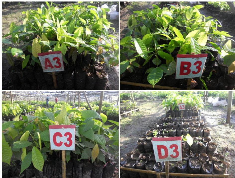
Figure 3. The symptom of Phytophthora seedling blight disease; (A) row covers, (B) spraying of copper oxide 0.2%, (C) a combination of row covers and copper oxide 0.2% and (D) control (no treatment).

at a temperature of 20–30°C (Purwantara, 1990). High surface plants' humidity and wetness have a considerable influence on the occurrence of infectious diseases (Purwantara, 1990), so that seedlings which are not protected by row cover and 0.2% copper oxide has higher potential to be infected by Phytophthora seedling blight disease, as shown in the control group (Figure 3 D).