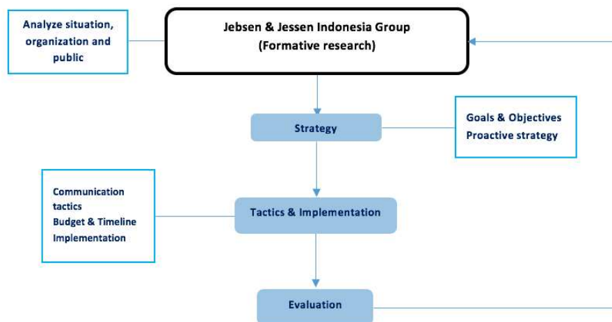
FIGURE 3. Jebsen & Jessen Indonesia Group strategic communications framework

was consisted of four activities: Media content analysis, Cyberspace analysis, Trade show and event measurement, and public opinion polls.