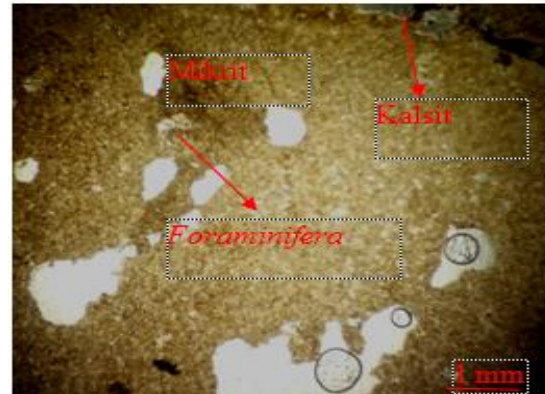
Fig. 3. Micritisasi microbial on Foraminifera Fossil in Limestone (Petrographic Analysis cross nicol with magnifications 10x )

grain drilling activity by endolithic algae, fungi and bacteria around skeletal.