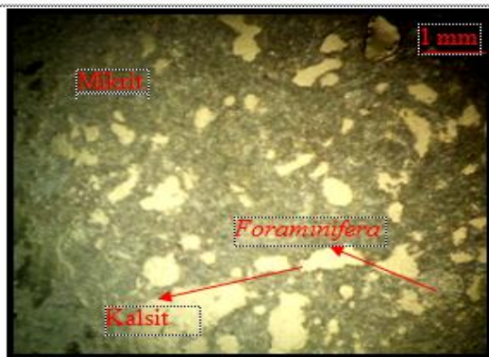
Fig. 1. Micritisasi microbial on Foraminifera Fossil in Limestone (Petrographic Analysis cross nicol with magnifications 10x )

serves to protect the fossil shells so that it is more resistant to the dissolution. (Figure 1)