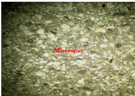
Fig. 5. Changes in the size of the matrix becomes larger microspar (Petrographic Analysis cross nicol with magnifications 10x ).