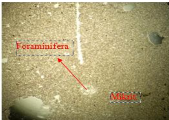
Fig. 4. Micritisasi microbial on Foraminifera Fossil in Limestone (Petrographic Analysis cross nicol with magnifications 10x ).

shows the diagenetic environment of meteoric vadose (Figure 6).