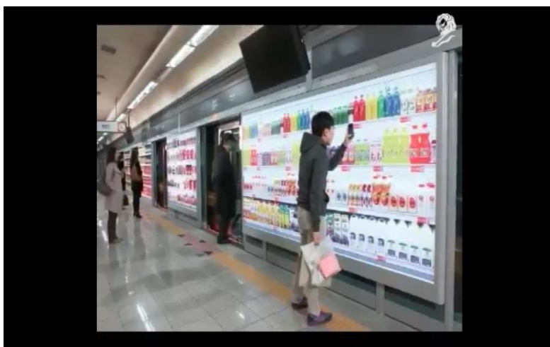
Figure 2. Screenshot from Video

The fourth criterion is divided into two points, “taking what exists and evolving it into a different dimension using new technologies” and “presenting the learner with a wide range of options”. In the first point, blended learning class should use what exists in real world and evolves it into new dimension (Thorne, 2003). In the online class, the teacher used the authentic materials (nine out of ten meetings), such as online news, magazine article, and online videos, to support the learning process. With the video shown in Figure 2, the teacher managed to use the video to teach students prediction skills. According to McNamara (2007), this skill encourages students to tie the summaries together in a global level. The second point Thorne (2003) said is blended learning class