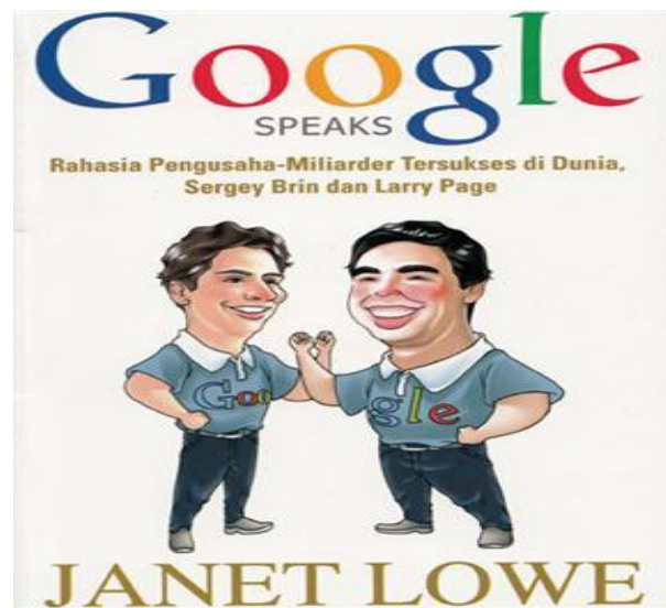
Indonesian Book Cover