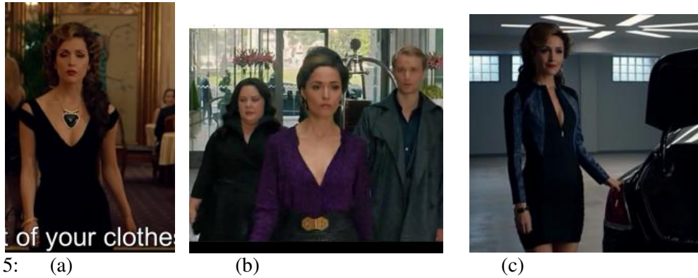
Figure 5: (a)