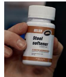
Figure 2: (a) (b) (c)