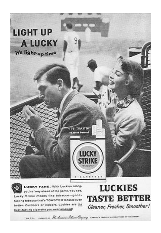
Picture 4.2 An advertisement of Lucky Strike from TV Radio Mirror Magazine Vol. 46 No.1, that was published on 1956

on 1956. Although those advertisements show male figures, the representation of them are different.