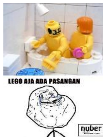
Panel 2: Even Lego has a girlfriend

The first concept built in the representation of FAG is as a single. In the data collected, there are some strips that represent FAG as a single in a negative way. There are three concepts constructed in this point, which draw ‘single’ as those who desperately need to be in a relationship, unattractive and coward.