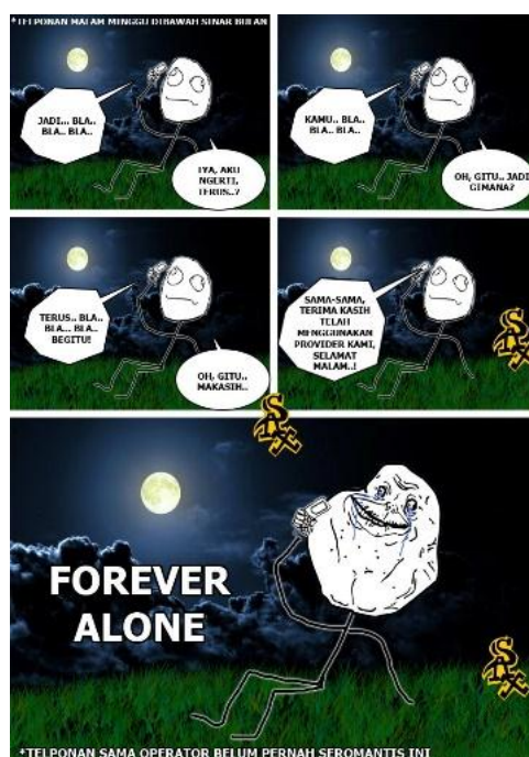
Panel 1 : *calling someone on Saturday night under the moonlight [balloon text] Someone on the phone: So, bla, bla, bla | FAG: [balloon text] yea, I know. Then? Panel 2 : [balloon text] someone on the phone: You're bla bla bla | [balloon text] FAG: Oh, I see. Then what should I do? Panel 3 : [balloon text] someone on the phone: Then, blab la bla | [balloon text] FAG: oh, right. Thank you. Panel 4 : [balloon text] someone on the phone: You are welcome, thank you for using our provider. Good evening. Panel 5 : Forever Alone *calling phone officer has never been this romantic.

In picture 11, at first readers may think that there are love birds who are in love and then they kiss. However, in the later panels, readers see that actually the scenes are created by FAG who really wishes to be the man (Barbie) that he is playing with.