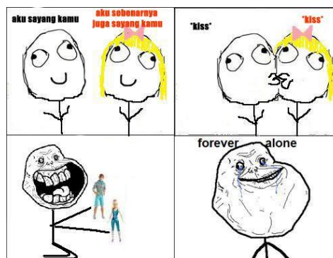
Panel 1 : Boy: "I love you" Girl: Honestly, I love you too Panel 2 : Boy & girl kiss

The first expression represented by the comic strip is how FAG often imagines himself to be in relationship as below,