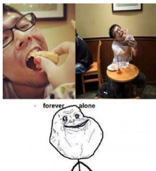
Picture 16. being lonely

In comic strips above, readers can see how FAG reacts to his loneliness, that is by playing with himself as if there is someone who plays with him. This point is also strengthened by the next picture below,