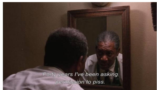
Screenshot 10. Routinization as the grounding of social life

In Red's case, although the role of structure was so strong, helped by Andy's agency, Red's agency appeared as he finally chose not to buy a gun and committed a crime again to be sent back to the prison. His consciousness and purposiveness enabled him to break loose from the grip of prison structure. This example shows again the interplay of Red's agency vis-a-vis prison structure.