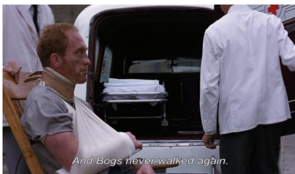
Screenshot 11. The effect of structure of domination to Boggs