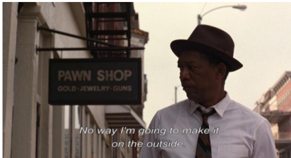
Screenshot 5. Prison structure’s grip on Red after 40 years of being institutionalized

could ever die. Finally, Red made the choice to go and meet Andy, otherwise he would have ended up in prison all his life. In the room where Brooks carved on the wall “Brooks was here”, before committing suicide, Red also carved a similar sentence next to it “so was Red”, making a different choice to keep up living outside prison although the conclusion was unclear to him at that point (Screenshot 6).