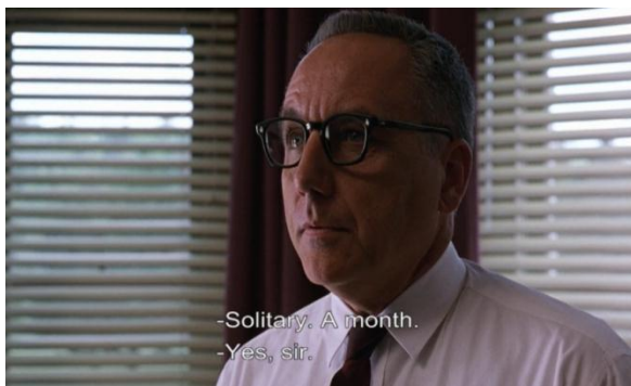
Screenshot 8. Norton made use of the prison structure as a warden with legitimate power to determine people's life and behavior

story told by Tommy Williams, Warden Norton insisted on not finding the truth because of the two reasons mentioned earlier. When Andy persevered to get justice and pushed Norton by mentioning something about laundering the tax money, he was put in a solitary cell for a month (Screenshot 8). This cell effectively made someone suffer a lot so that Andy later on even admitted that he was guilty and quitted his idea of getting justice in line with the structure or system since he schemed his own way to find one. This example shows how the structure of the prison which gives a big power to the warden changes Andy's behavior and belief in his helplessness. It can be said that this example shows the interplaying working of prison structure and Norton's agency. Norton will not be able to exercise his agency if he is not taking the position of a warden in the prison structure.