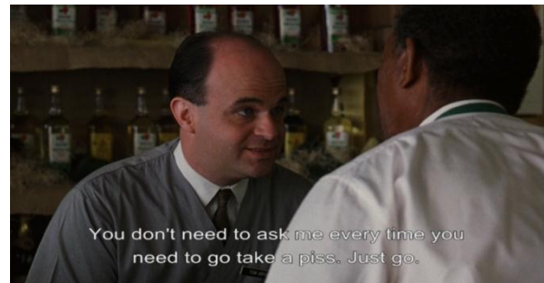
Screenshot 9. Institutionalization of structure

Giddens (1986) said about the basic requirement of social systems: "The structural properties of social systems exist only in so far as forms of social conduct are reproduced chronically across time and space. The structuration of institutions can be understood in terms of how it comes about that social activities become 'stretched' across wide spans of time-space" (p. xxi). Further he said that the "fundamental concept of structuration theory" is routinization (p. xxiii). This is what Red experienced, which he called as being "institutionalized" for forty years (Screenshot 9).