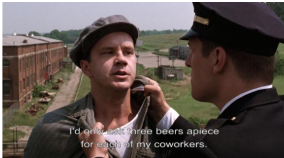
Screenshot 1. Andy's agency and the risk of being pushed off the roof

inmates was changed too. Since that day Andy's inmates respected and supported Andy, even the prison guards protected him from being bullied by Bogs (a fierce inmate) and his gangs. This example shows that even though Andy's agency can make a change on the relation of the inmates with the guards and among the inmates, it still needs the approval of Captain Hadley to accept Andy's offer and to grant his request. This shows an interlocking relation between agency and structure.