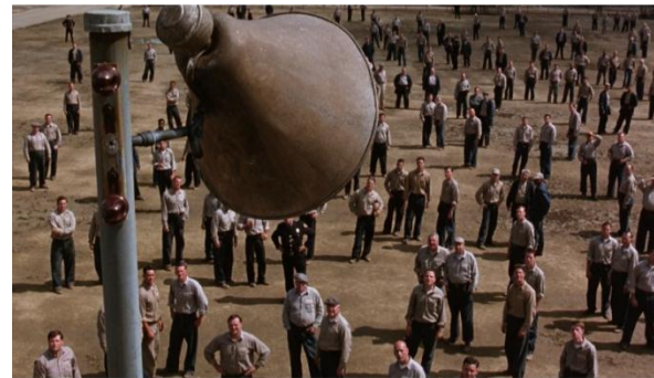
Screenshot 7. The stunning effect of music for the inmates

weeks. This example shows how any effort of violating or undermining structure of domination (no matter how small it is) will result in a sanction, which is severe in Andy’s case.