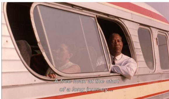
Screenshot 6. An inmate broke loose of prison structure’s grip to start living a new life

The next example of Andy’s agency can be seen after Andy got donations of books and some gramophone records and he played a record in the prison guard’s office. Music in Shawshank prison was never heard, and Andy played the record and put it on the prison loudspeaker. It gave a stunning effect to all inmates as if it were a miracle for them (Screenshot 7), and it drove all the guards and Warden Norton furious. In this example, Andy’s agency undermined the prison structure by doing something that was never done before in it. Furthermore, Andy played the record without asking permission from the guard or Warden Norton (who had power to determine what was accepted or what was not). Indeed, Andy’s agency could make a change in prison, but it was only for a while. Nevertheless, it was not only a fancy change of habit in prison, but it gave such a profound impact to the inmates that Red made the following statement, “And for the briefest of moments, every last man at Shawshank felt free.” However, Andy’s action resulted in his being put in the hole (a stifling cell to give a punishment to disobedient inmates) for two