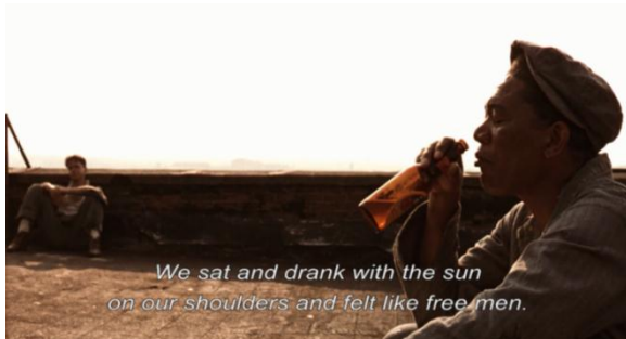
Screenshot 2. Andy's agency created a different atmosphere

The second example of Andy's agency was when Andy asked for some fund to add the book collections of prison library from Warden Norton. Of course, changing the structure in the prison regarding the library could be said to be impossible. Based on Brooks' experience (the inmate librarian) who had been imprisoned for more than 50 years and who had experienced six times of warden change, the request for fund to add the library book collections was never granted (Screenshot 3). However, with Andy's resource of financial and tax knowledge, which finally made Warden Norton also ask Andy for financial advice, Andy was allowed to write a letter to the Senate once every week (Screenshot 4). After 6 years of sending letters without break, Andy's request was granted. From the three-layered structure, it can be seen that Andy employs the resource of his relationship (facility) with the warden to get a permission to write letters to the Senate (domination) and the modality he applies to communicate is an interpretive scheme of "education" which finally gives power to him to get what he wants.