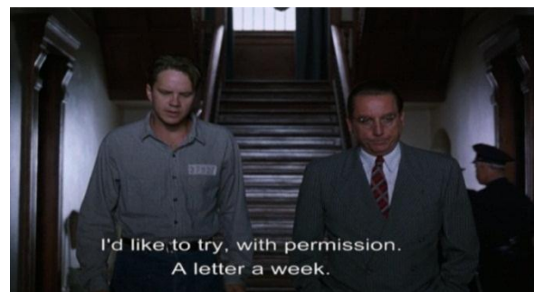
Screenshot 4. Strong structure and agent's negotiation with Warden Norton

As Warden Norton himself said that there were only three ways to spend the taxpayers' money for prison, namely for more walls, more bars, and more guards, which meant that a request for more books was sheer impossible. However, through his agency, Andy tried to negotiate with the Warden to get a permission to write letters. Actually, Warden Norton gave Andy a permission to write letters only to make him happy, but finally Andy's request was granted. This example shows that Andy's agency can change a part of the prison structure regarding the library although he needs to negotiate with the warden (representing the structure) to get the permission to write the letters. Thus, it shows that there is an interplay of Andy's agency and the prison structure.