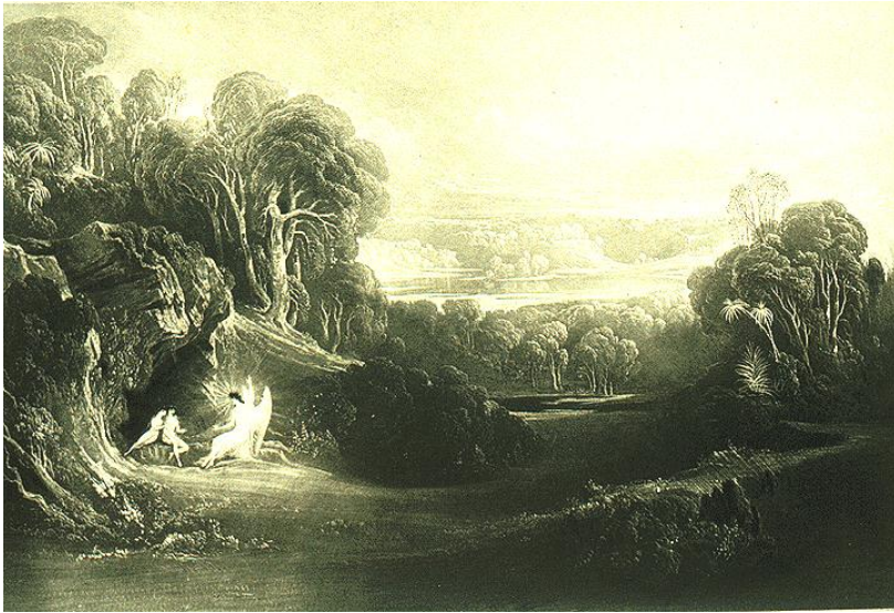
Fig. 4. John Martin, Raphael Conversing with Adam and Eve