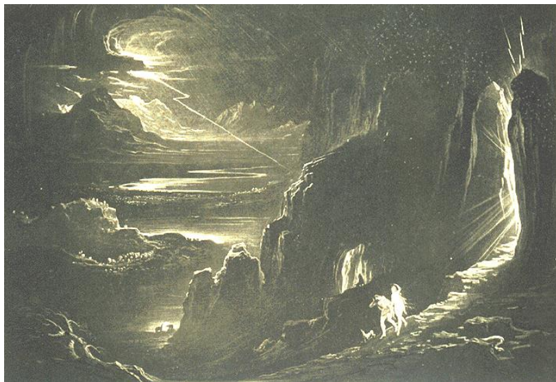
Fig. 2. John Martin, Expulsion of Adam and Eve