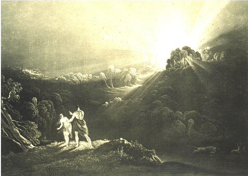
Fig. 1. John Martin. Adam and Eve Leaving Eden

presence of God the Father and the Son from his set of mezzotints. Satan's power is ascribed to his technological advance and his triumphant gesture in his palace with its scientific architecture consolidating the British pride at the Western civilization. Satan's throne being situated on top of a sphere—that symbolizes Earth—is the containment of the discourse of the civilizing mission to tame the savagery of those places where the Western civilization is "missing." Adam and Eve have to struggle for existence, a struggle that has been foreshadowed in the image of the deer chased by the lion. The extinct dinosaurs, once the emperors of the natural world, reinforce the discourse of the struggle for existence. In Martin's illustrations, the only way to win the struggle seems to be through the achievements of science and technology. The only powerful figure, the only one sure to survive, is Satan who has managed to totally tame and remove the tumultuous, gothic nature. Martin, living at a time when creatures had to struggle for existence, was interested in the achievements of science and the establishment of civilization as the means of survival. Satan has accomplished to colonize Hell and is going to colonize the whole world with his scientific and industrial achievements; therefore, he is triumphant.