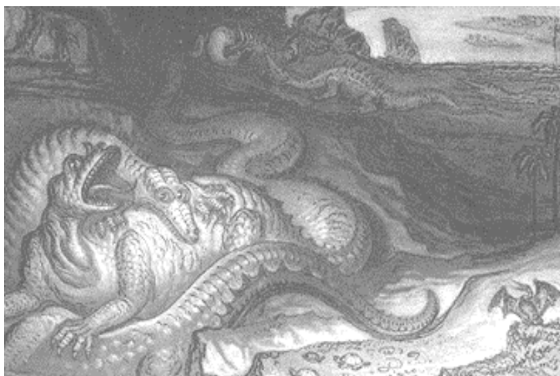
Fig. 3. John Martin, The Country of Iguanodon