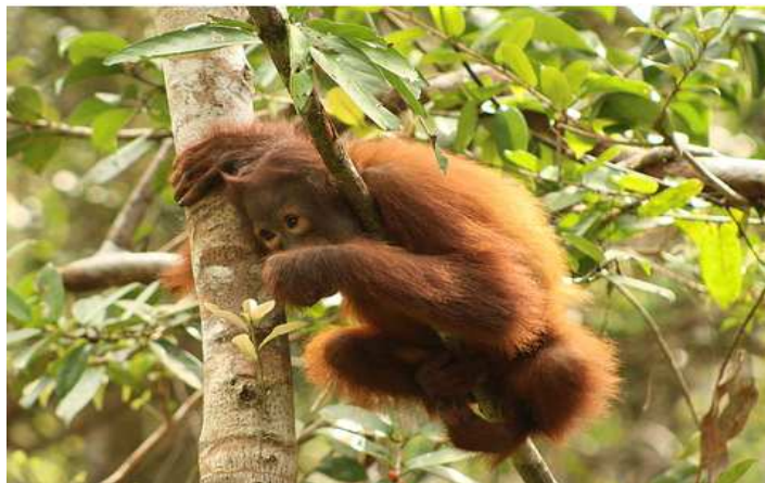
One of the endangered Orangutan from the tropical rainforest in East Kalimantan

Despite holding an important position as the lungs of Asia, Indonesian forest areas are continually decreased by the rapid deforestation for national economic development interests and world market demands. The Indonesian forest area in general has declined by 40 % between 1950 and 2005 (Arnold, 2008). In addition, the East Kalimantan forests, considered the oldest rain forest in the world and one of the only remaining habitat for endangered orangutans, face the same deforestation activities from the forestry productions in both the New Order government and the decentralized government following the 1998 reformation.