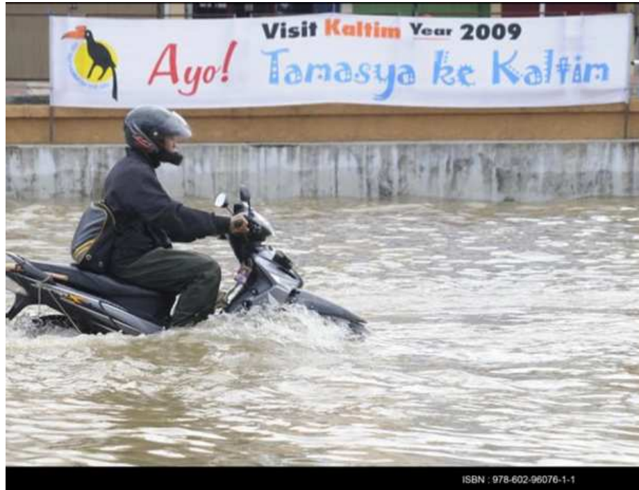
Samarinda's regular flood (Jatam, 2010).