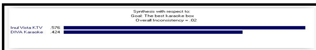
Figure 2. Result of Best Karaoke Service