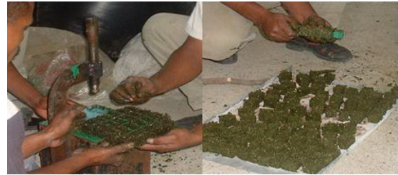
Figure.1 Producing Cubes Manually.

manually filled and placed in the sun to dry. Drying took from 2-3 days depending on the strength of the sun. Using this method, farmers could make cubes per day. Each cube was approximately 3x3x3 cm 3 in size and weighed 15 g. This manual method can still be improved. Changes suggested are an increase in the number of cubes produced per mould as well as the number of moulds available to the farmers. This would allow cube production to be increased and would be beneficial for villages where it would be difficult for low income farmers to obtain machines and equipment.