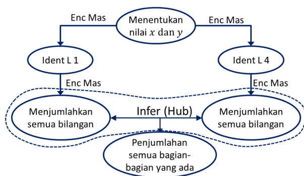
Figure 2. The S1' process of Encoding and Inferring in the Source Domain

The process of structuring in S1 analogical reasoning can be represented in Figure 2.