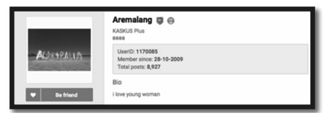
Figure 1 Screen Capture of Aremalang's Profile Page

Accompanying ID Picture, on Kaskuser's individual Profile page, user would find the chosen name of Kaskuser. Most of the Kaskusers use anonymous name, which they created as an ID. As seen on Figure 1, Aremalang is a premium member of Kaskus that called KASKUS Plus. This research focuses mostly on Bio column where Kaskusers could opt to use Kaskus's default "Agan ini masih malu-malu nyeritain tentang dirinya" statement, or to compose new words as a form of expressing self.