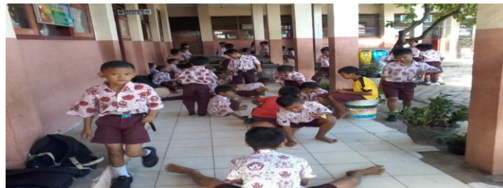
Figure 1. The students were playing marbles outside the classroom

As many as 83% of students correctly answered questions about the relevance of the number 10 to number 5. The ability of the student connection because the influence of outdoor learning mathematics that has provided the opportunity for students in linking various objects in everyday life. Students relate the number of marbles with numbers and a game of marbles with operations in a game of marbles. Purwanto (2008), outdoor learning can bring learners with learning objects. The real learning objects as a context for helping students understand mathematical connections. Nuriadin (2015) explains that there are differences in the students ability in mathematical connection taught through contextual learning with conventional. Beside, Martin, Falk, and Balling (1981) explain learning by a field trip to a novel setting is a better understanding of the details and nature of the cognition. In this case the game of marbles with the concept of numbers and their operations. This is shown in Figure 1 below.