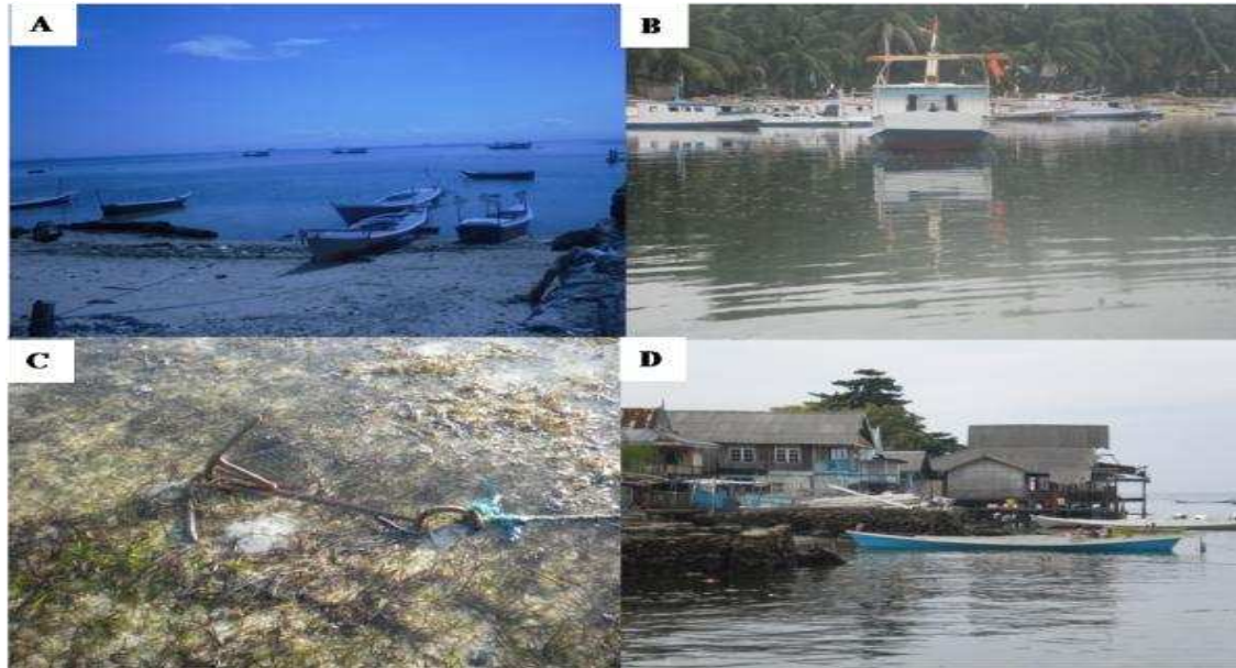
Fig. 2. Common boating activities in Indonesia. (A,B) Parking boats in seagrass beds, (C) anchoring in the seagrass beds as a part of boat parking, (D) boats as the only transportation facility for the local coastal communities.

2004). The seagrass can make self-recovery and regrow in propeller scars, however it takes time and species dependent (Dawes et al. , 1997).