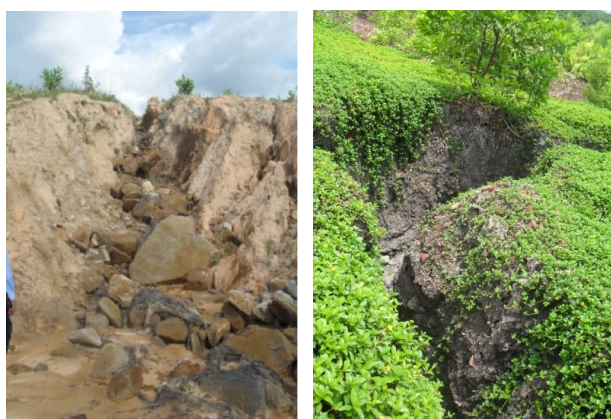
Figure 2. Soil erosion at post coal mining site in Kutai Kartanegara district

Script: ST = very high, T = high, S = moderate, R = low, SR = very low.