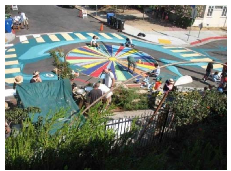
Photo 1. Bimini Place with Street Party and Road Painting

Example 1. An example was the Bimini Place road painting and street party event held by the ecovillage members of Los Angeles in September 2009 (Newton, 2008). The activity was community initiated and mobilized with the goal of improving the road intersection through creation of a road paint mural and a bicycle lane. There were criticisms from other people because of the overriding decision of the community members. But this was a very good example of an activity encouraging situated learning and a sustained practice at the same time. The blogs created by the members to showcase this activity serve as resource site already.