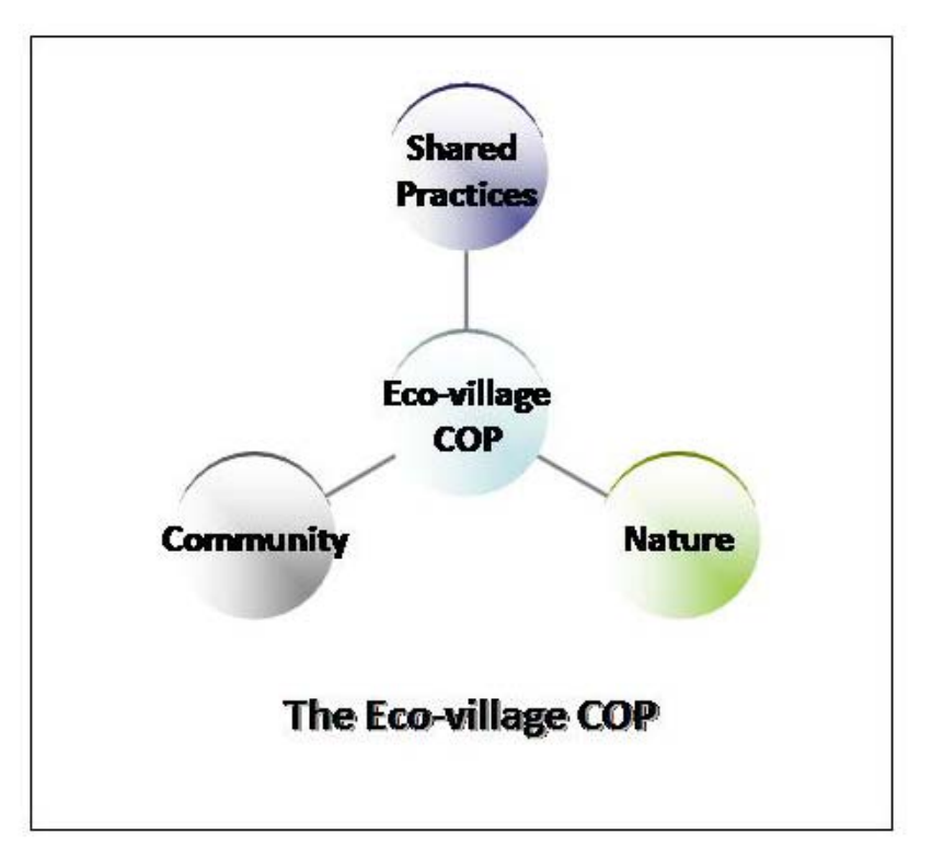
Figure 3. The Eco-village COP Model