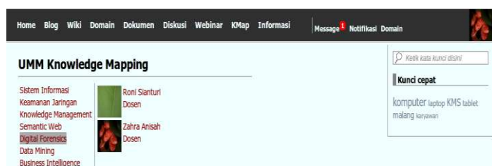
Figure 6. Knowledge Mapping (KMAP)

Figure 6 shows a KMAP module. The module arranges the users by their qualifications. It is useful for knowledge mapping in the organization.