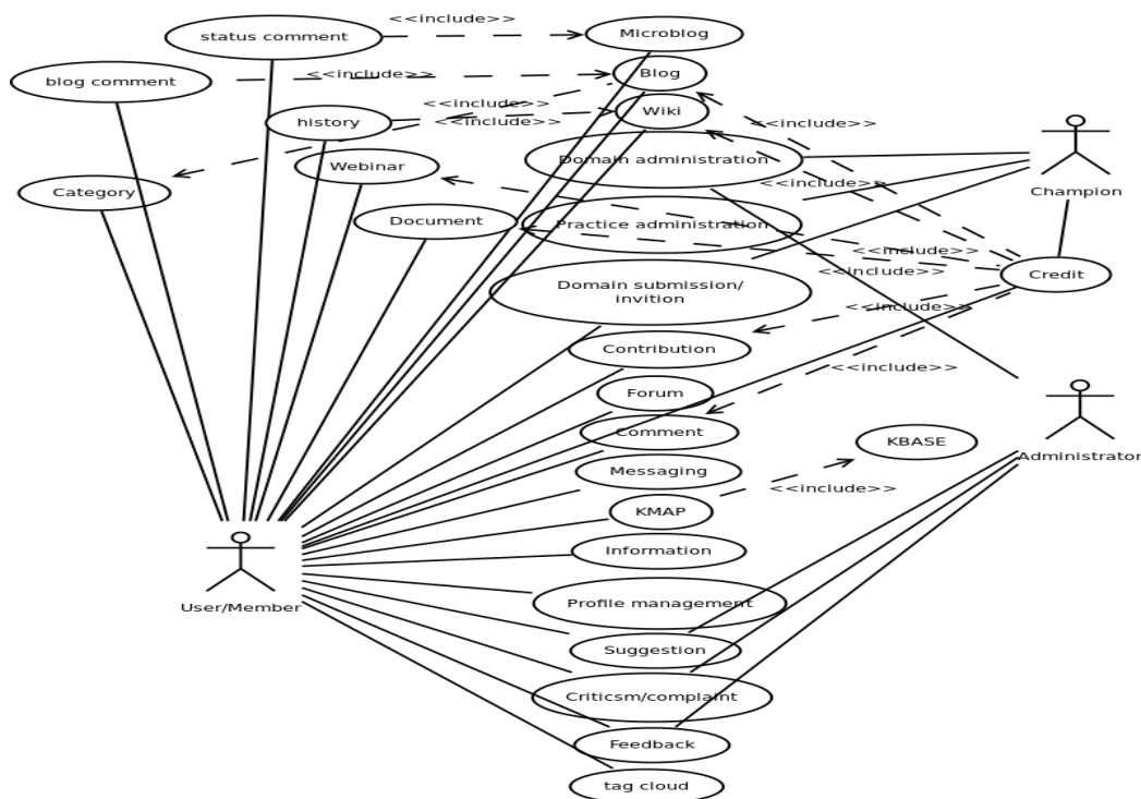
Figure 3. Usecase diagram of KM