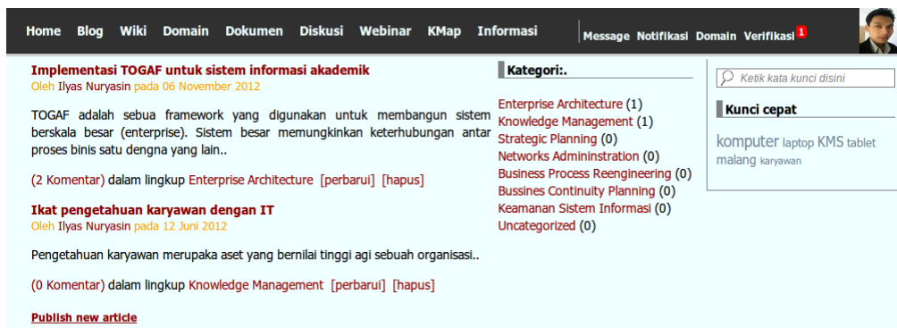
Figure 4. Blog

interconnection (internet). Figure 4 shows screenshots of the Blog. This application modul provides the users to post their knowledge into categorized subjects are provided.