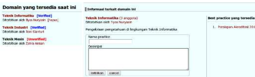
Figure 5. Domain and practice

practices. The domains will be verified by administrator to ensure that the domain is owned by the correct champion.