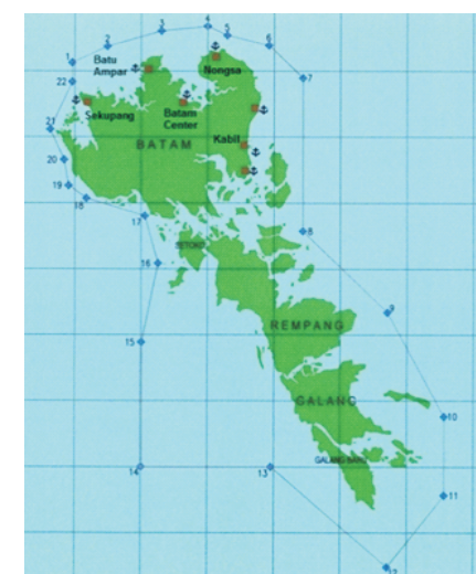
Figure 5: The Working and Interest Area of Port of Batam (source: Minister of Transportation Decree No. 77/2009)

The other option is expanding to the water area. Currently there are several transshipment activities in the water like the ship to ship transfer as well as the operations of Floating Storage Offloading (FSO) facilities in the other part of the Malacca Strait, mainly in the Port Klang and Port Tanjung Pelepas in Malaysia as well as in Port of Singapore. There is a raising similar model of floating container terminal based on the FSO principle that is initiated in the Europe, called the Floating Container, Storage and Transshipment Terminal (Baird & Rother, 2011). By using one container ship, the port could easily reach the throughput of 800,000 TEUs per annum. There is also another opportunity in the water. Currently some companies operate the space to anchor (park) for the vessels and then receive additional services such as tank cleaning as well as ship repairs. The Southern part of Batam is the ideal place to provide this kind of service. Figure 5 shows the whole working area in Batam's water.