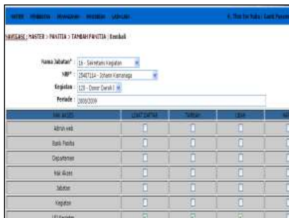
Figure 5. Inputting members of Implementation Committee