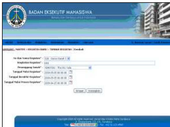
Figure 4. Inputting New Activity

After the implementation committee was formed by the coordinator. The coordinator began to write a proposal for this activity by accessing the menu on creating Proposal. A proposal had to be created for each activity. Figure 6 showed the process of creating a proposal.