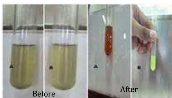
Figure 1 Identification of phytomelatonin in the etanholic extract of Ulva lactuca L (A)in Dragendrof reactant and (B) Mayer reactant

Obtained extract was preliminary identified to determine the prescence of alkaloid compound, because phytomelatonin was classified as alkaloids. Identification showed that reddish