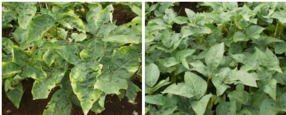
Figure 1. Soybean plants attacked by CMMV (left) and healthy plants (right)