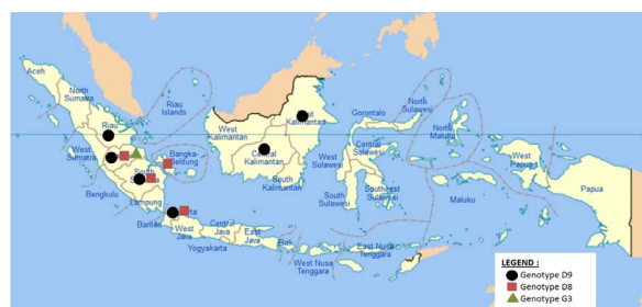
Figure 2. Distribution of Measles virus Genotypes in Indonesia, 2014