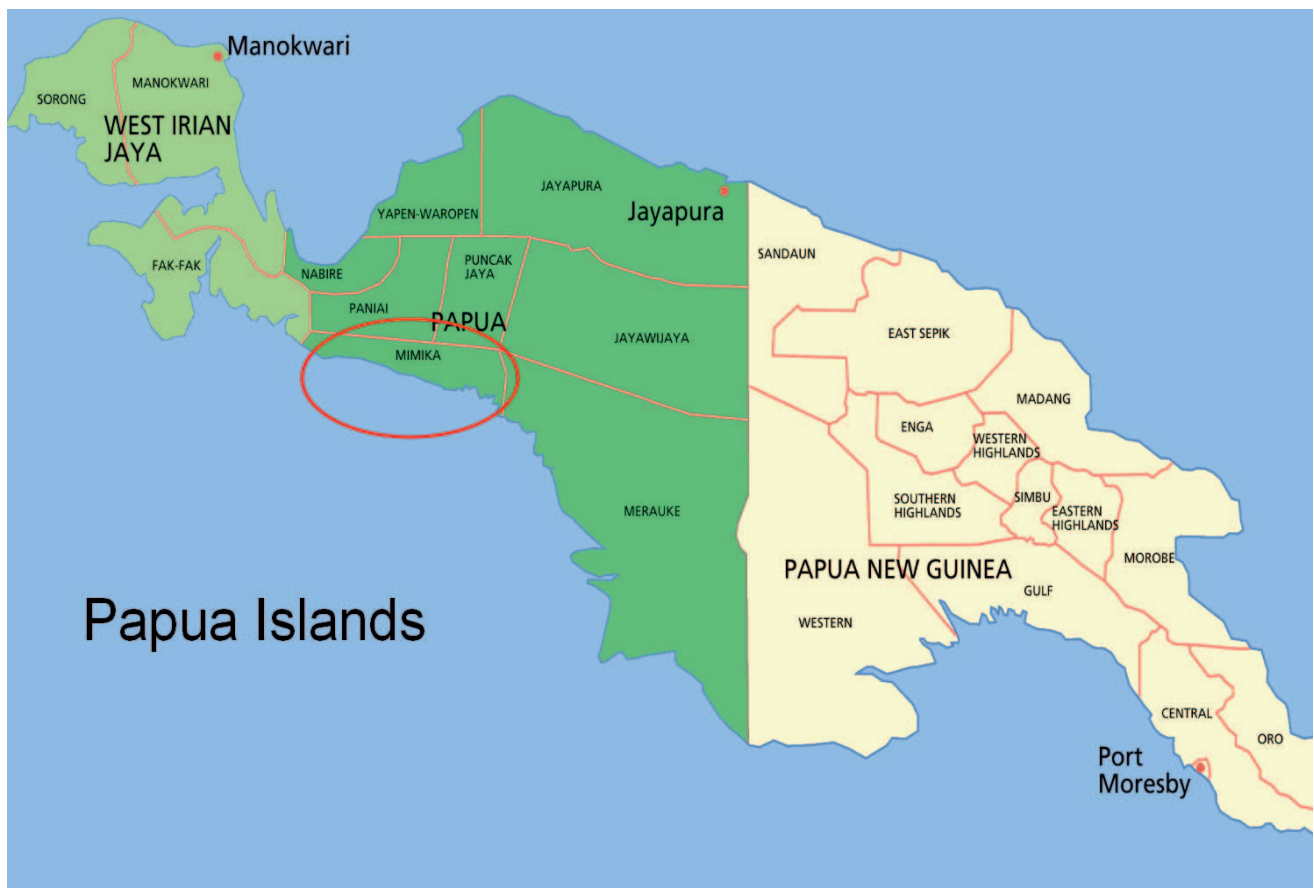
Figure 2. The map of Mimika District in Papua Province

Dengue infection has spread in all provinces in Indonesia and caused outbreaks annually. Several studies had reported dengue outbreak in several cities in Indonesia 9,10 in which both young age and older age groups were infected by DENV and had dengue hemorrhagic fever (DHF) incidence. 13 Mimika district is one of districts from Papua province, located in Irian Island, the Eastern part of Indonesian archipelago (Fig. 2). This area is known as non-endemic area of dengue since there was no data of laboratory-confirmed dengue cases reported from Mimika district, Papua province. Here we reported the first cases of laboratory-confirmed and genotyping of DENV taken from dengue outbreak in Mimika district, Papua Province, Indonesia, in 2012.